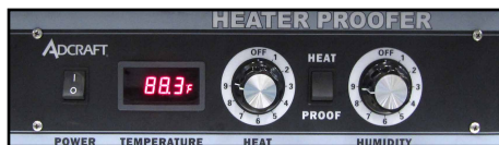
Removable drawer with LED thermostat